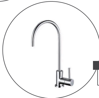
Stainless Steel 304 RO Gooseneck Faucet FU-304S7