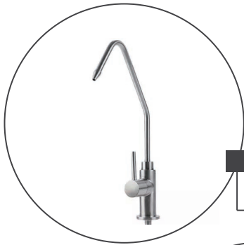
Stainless Steel 304 RO Faucet A Type FA-01

-High Quality Lead Free Stainless Steel #304