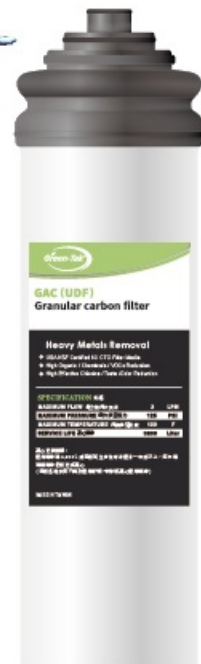
02 Bamboo GAC (UDF) Carbon Filter Cartridge