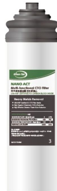
03 NANO-ACT CTO Filter Cartridge