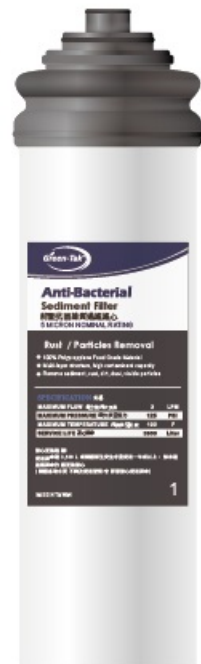
01 Anti-Bacterial PP Sediment Filter Cartridge