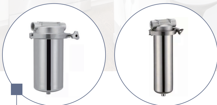
Stainless Steel Water Filtration System